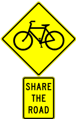
W11-1 / W16-1 Share the Road with Bicyclists assembly

What signage is available to alert and educate motorists about sharing the road with bicycles? Is there a preferred sign, which can be recommended for consistent use in Illinois? Ride Illinois has been studying this issue in preparation for collaborations with road agencies and possibly local bicycle clubs.