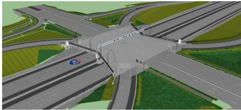
Proposed Single Point Interchange design for Barrington Road interchange on the Jane Addams (I-90) Expressway.

Reasonably expected revenue proposals include a state motor fuel tax increase (with long-term replacement), a regionally-imposed transportation user fee, congestion pricing on the existing system, an end to the 45-55 state funding split and variable parking pricing. The committee discussed the difficult funding situation and the struggle to properly address transportation needs in the region. CMAP will present the initial update of Major Capital Projects to the CMAP Transportation Committee on March 7. The full draft plan update will be complete this summer with an opportunity for public comment.