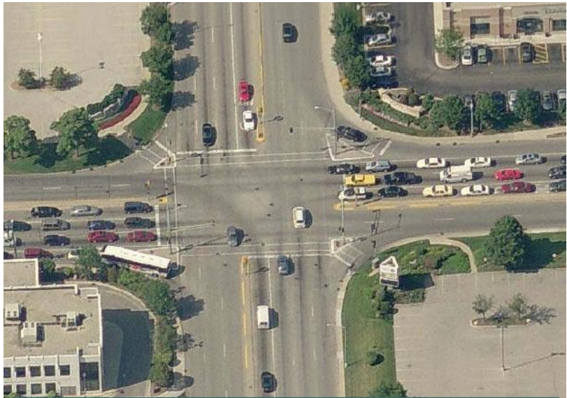
Golf Rd and Skokie Blvd Intersection is programmed for an intersection improvement in FFY 09

improving transit service, completing the existing highway network, strategic improvements to the local arterial road network, and providing safe bicycle and pedestrian facilities.