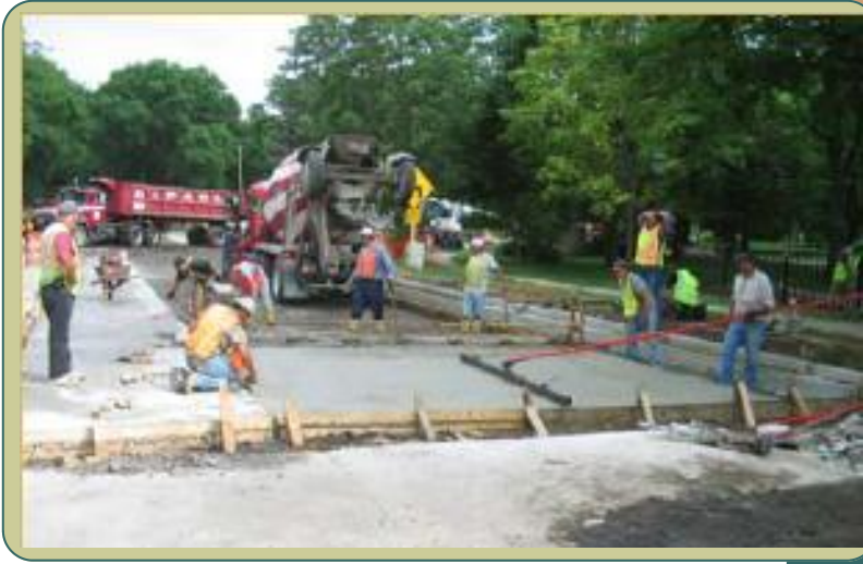
Concrete base course placement on Sheridan Road in Wilmette