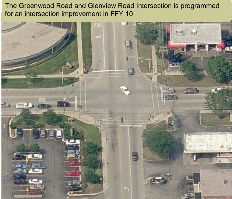
The Greenwood Road and Glenview Road Intersection is programmed for an intersection improvement in FFY 10