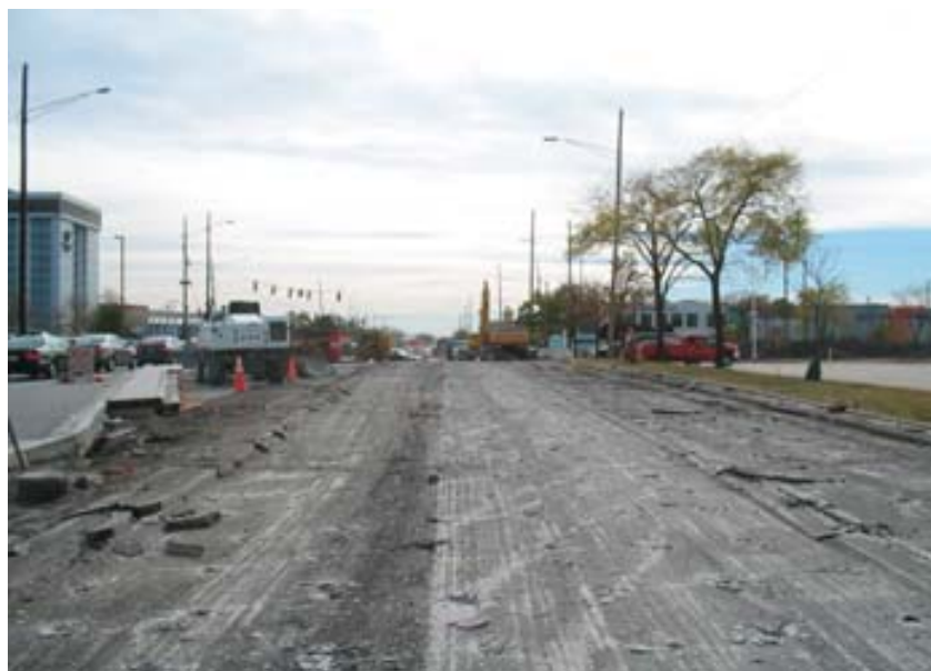
Pavement removal on Skokie Boulevard as part of the Golf Road at Skokie Boulevard intersection improvement project in the Village of Skokie.

The second table on page 4 demonstrates that the North Shore Council plans to obligate $4.89 million in FFY 2011. Because of the Council's negative balance, all projects advancing in FFY 2011 must receive advanced funding from the Chicago Metropolitan for Planning (CMAP) Council of Mayors Executive Committee. The Old Orchard at Skokie Boulevard intersection improvement project is the only North Shore STP construction project scheduled for FFY 2011. If the Council is able to obligate funding for all programmed projects in FFY 2011, it is estimated that the Council will enter FFY 2012 with a negative balance of roughly $8.65 million.