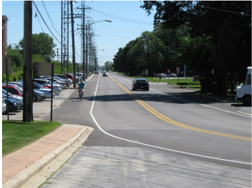
Morton Grove's Lehigh resurfacing project was let in FFY 2009 and constructed in FFY 2010.

As part of the American Recovery and Reinvestment Act of 2009 (ARRA), the North Shore Council of Mayors received $5,944,773 for surface transportation projects. The legislation required the council to obligate 100 percent of funds by March 2010. The council obligated approximately $2.76 million in FFY 2009 on five projects. The council obligated the remaining $3.19 million of ARRA funding in FFY 2010. The North Shore Council was able to provide partial funding to three additional projects due to low bids in the original project lettings. Staff from members of the North Shore Council's member municipalities and IDOT worked diligently to de-obligate and re-obligate funds to ensure that 100 percent of the ARRA funding allocated to the North Shore Council was obligated. The table outlines the North Shore ARRA projects and the year of their obligation.